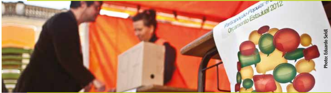
Voting priorities - August/2011