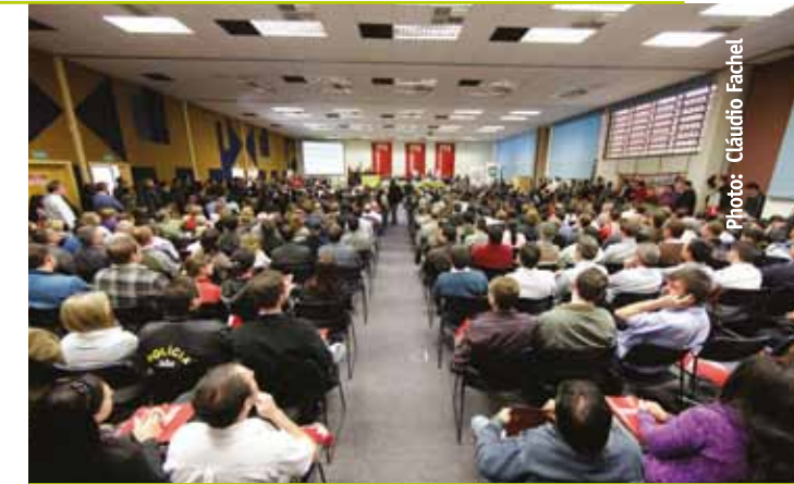
Participatory PPA Regional Seminar in Passo Fundo

In March, April and May, the PPA Multiannual Plan was prepared in a participatory manner for the 2012 – 2015 period by nine regional seminars that brought together 6,000 State leaders and 350 institutions. Those meetings produced 12,000 suggestions, which were translated into 23 areas and 86 PPA programs, delivered to the Legislative Council.