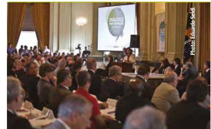
CDES Full Meeting at Palácio Piratini

Inspired by the experience of the National Council, the (Rio Grande do Sul) state government installed the Social and Economic Development State Council (CDES). With 90 councilors, Thematic Chambers, and regional meetings, the CDES worked the first year to prepare directives on State development and sent them to the Governor, establishing an important concentration between several industries and the Government about themes of great relevance.